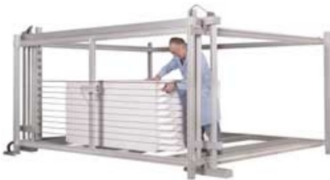
MW 2500 Medium with TurnTable and Lathe